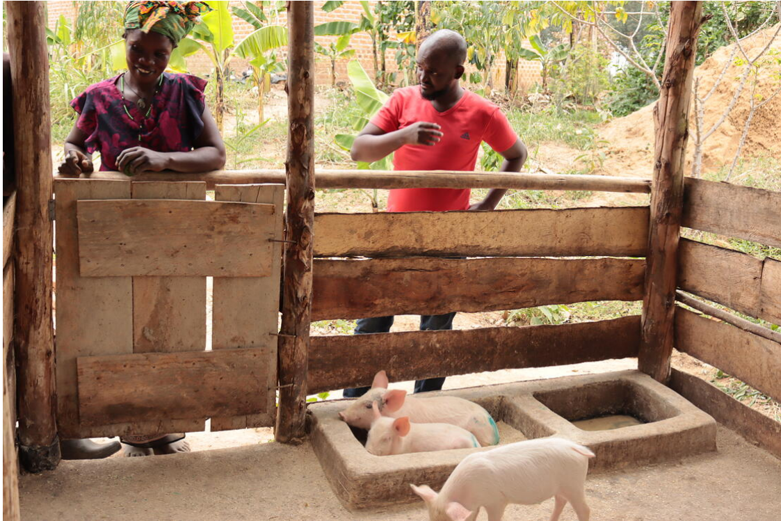
A SCOBA member showing us her Piggery Project recently when we visited her home

animal rearing to create sustainable sources of income, which was difficult before because there were no financial institutions in this area. Apart from goats, some have started piggery projects and poultry rearing. Many are investing in animals because Lwengo is usually affected by dry spells that do not favour crop production. Animal husbandry is more secure and tends to have a high return on investment and has ready market. That is why most SCOBA members are starting these projects since they have proven to be secure investments over time.