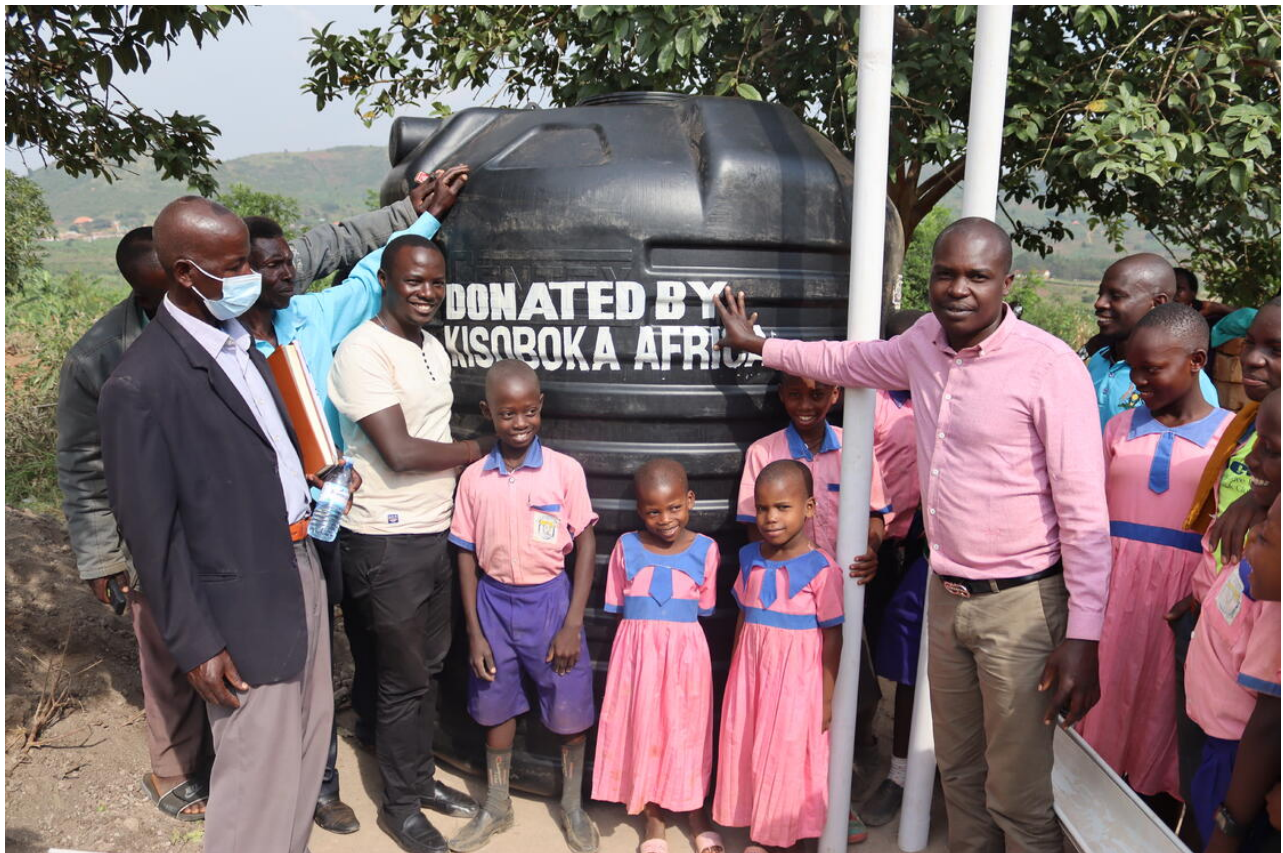
The school community of Kikoba and Team Leader Kisoboka Africa in front of the tank that was donated

We recently provided a water tank to our partner school St Micheal Kikoba P/S to solve the issue of lack of water storage. It was handed over to the school by the Team Leader Kisoboka Africa and received by their Head Teacher and School Management Committee. They were so grateful for the support given and said the tank would be of great help in solving water shortage at the school & improve Children's hygiene. We thank our partners, Experian Uganda who supported this initiative. Growing up in a clean safe environment is every child's right. Access to clean water & good hygiene practices keeps children thriving.