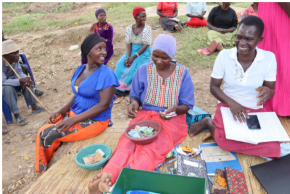
SCOPA GROUP MEETING HAPPENING AT LWENGYENYI COMMUNITY SCHOOL

Access to financial services is still a very big challenge in Uganda, especially in rural communities. Banks are mainly concentrated in major towns and their services are highly priced. According to global partnerships for financial inclusion, billions of adults still remain unbanked and inequalities persist due to this underbanked situation.