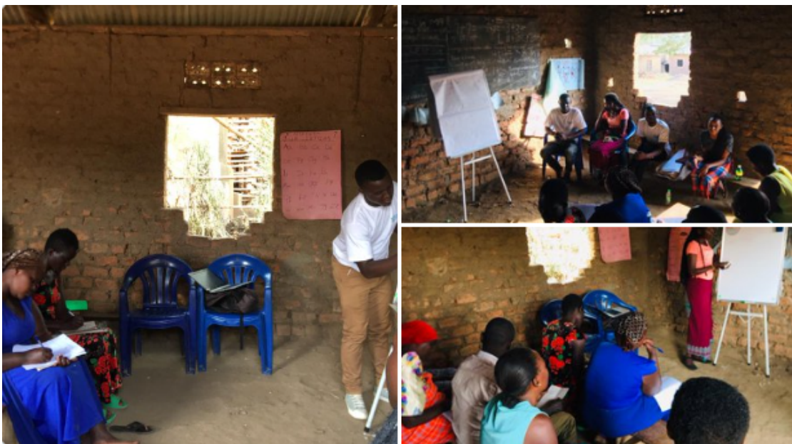
In picture above; Team Kisoboka in action as they train SCOPA members in poultry project management

For the next 17 months, these Kisoboka beneficiaries will be participating in the chicken development model pilot to improve their economic status.