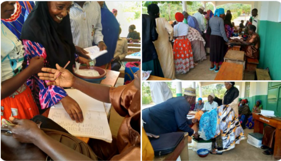
In picture - SCOA members of Bukumbula receiving their savings

We congratulate our beneficiary SCOA groups at Bukumbula upon finishing their cycle & saving more than $6000. This is far more than they saved last year which shows a big improvement as more community members embrace the SCOA program for development. To date, about $ 160,000 in total has been saved by rural Kisoboka SCOA members & this has helped a number of them build small enterprises that are changing their lives.