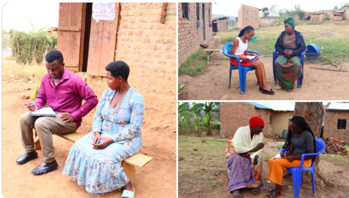
In pictures; Kisoboka Team participating carrying a baseline assessment for chicken model project

For the next 17 months, these Kisoboka beneficiaries will be participating in the chicken development model pilot to improve their economic status.