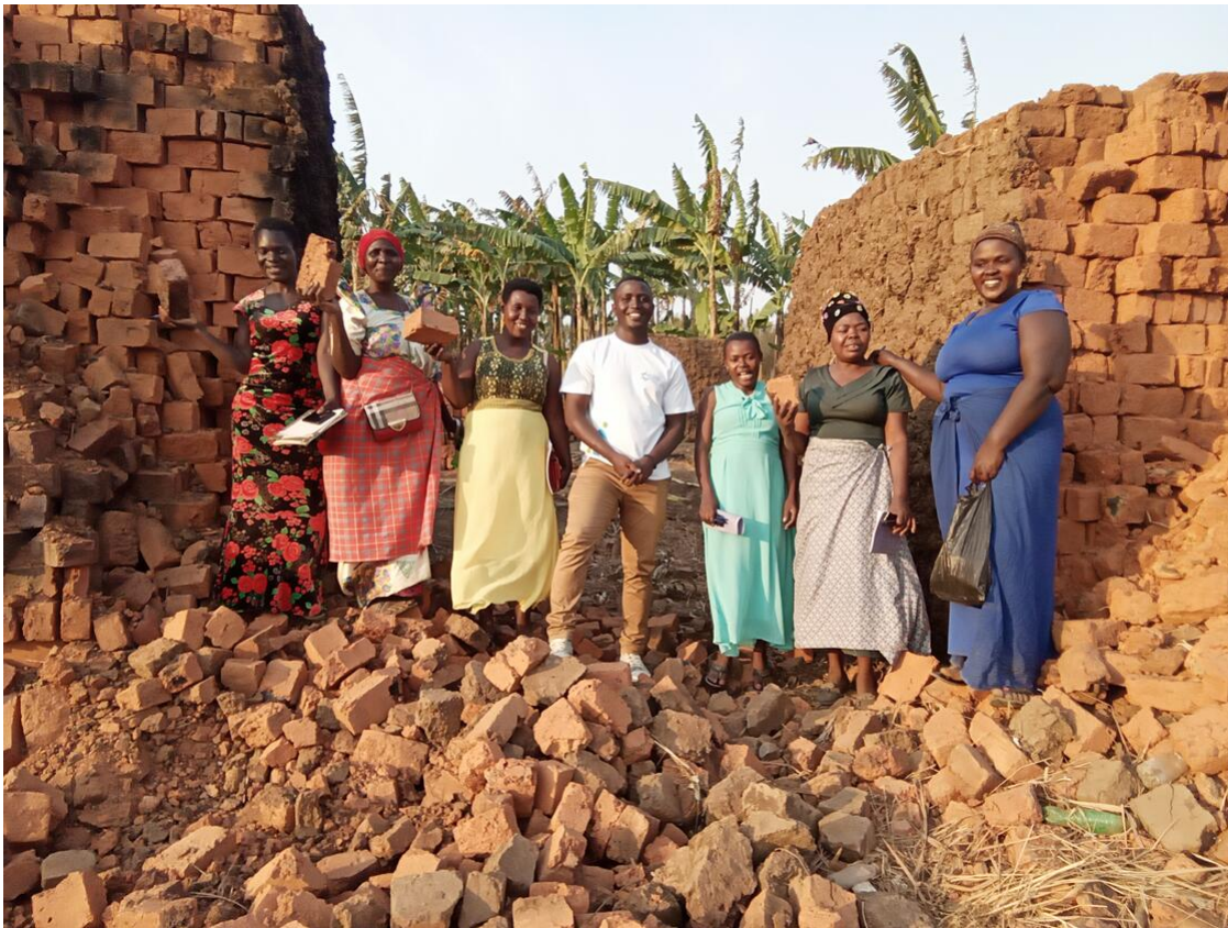
In Pictures: Our M&E manager with the group leaders of Lwengyenyi SCOPA during a visit their brick laying project